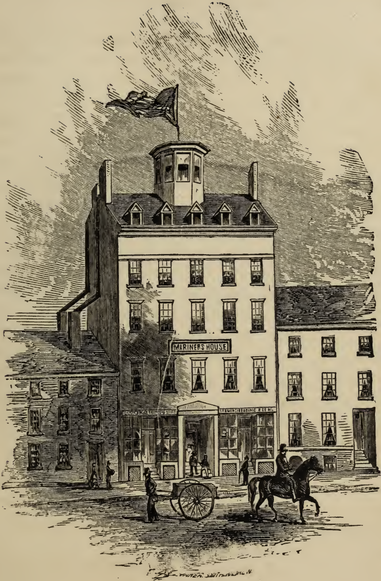
THE MARINER'S HOUSE, ERECTED BY THE BOSTON PORT SOCIETY, A. D. 1847.